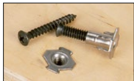
Sure-Set with T-nut Construction

Fabric: Over 50 standard fabrics and hundreds of designer fabrics to choose from. C.O.M. fabrics are usable upon approval; allow 0.8 to 1.1 yards of standard width fabric depending on model.