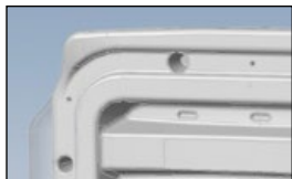
Innovative Flex-Fit™ Seat

Unmatched Comfort: The million cycle Everflex back, in concert with the Flex-Fit™ seat's contoured S-shape saddle, high resiliency 3 lb. foam cushioning and rolled front seat, creates all day comfort.