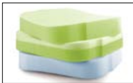
Commercial Grade Dual Density Biofoam