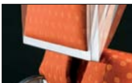
The Comfort Of Postureflex

We've brought together the industry's strongest frame, zero maintenance seat and longest warranty to provide you with maximum return on investment.