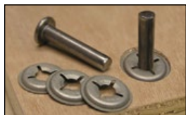
Dura-Lock II Back