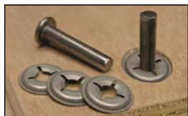
Dura-Lock II Back