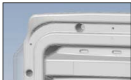
Innovative Flex-Fit™ Seat