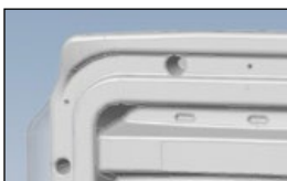
Innovative Flex-Fit™ Seat

Maximum ROI for Your Property: We've brought together the industry's strongest frame, zero maintenance seat and longest warranty to provide you with maximum return on investment.