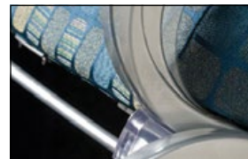
Million Cycle Everflex