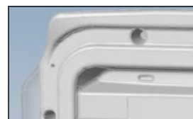
Innovative Flex-Fit™ Seat