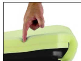
Seat Rolled for Comfort

Retractable Interlocks: These interlocks can be retracted to hide away when not in use.