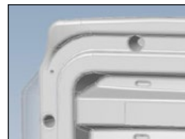
Innovative Flex-Fit™ Seat